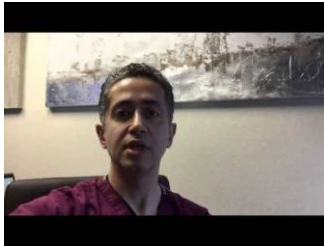
Bleeding Reduction Diet