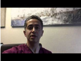
Bleeding Reduction Diet