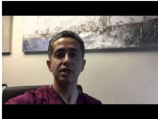
Bleeding Reduction Diet