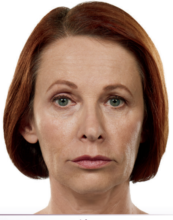
After smoothing lines with JUVÉDERM® XC and plumping lips with JUVÉDERM® Ultra XC

Please see Important Safety Information on the back.