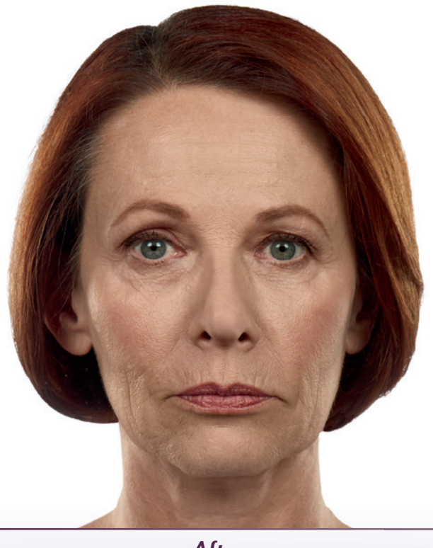
After optimal correction with IUVÉDERM VOLUMA® XC

Actual patient. Results may vary. Unretouched photo taken 1 month after second treatment with JUVÉDERM VOLUMA® XC. An additional 1.7 mL was injected into the cheek area for a total of 2.7 mL.