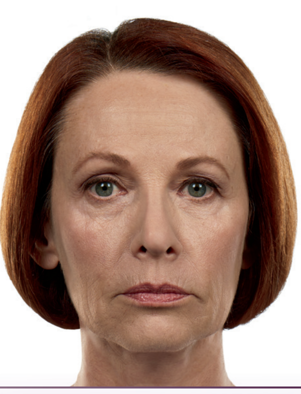
After 1 syringe of JUVÉDERM VOLUMA® XC

Actual patient. Results may vary. Unretouched photo taken I month after treatment with JUVÉDERM VOLUMA® XC. A total of 1.0 mL of JUVÉDERM VOLUMA* XC was injected into the cheek area.