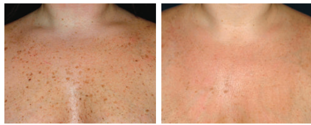
12 days post 2 treatments | courtesy of Brian V. Heil, MD