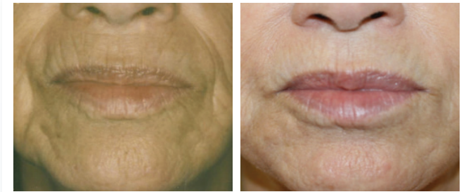
Forever Young BBL | 10 Years of Routine treatments