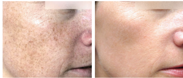
2 weeks post 2 tx | courtesy of Laura Brougher, RN