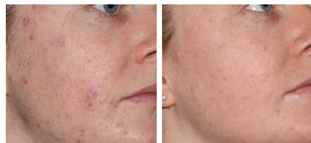
8 weeks post 5 treatments