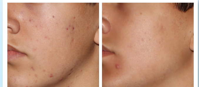
3.5 months post 9 treatments