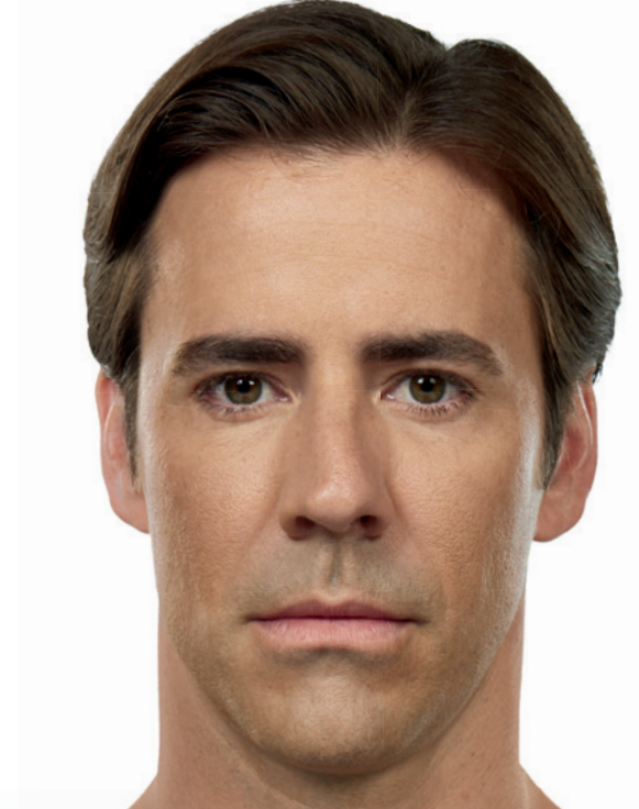
After smoothing lines with JUVÉDERM® XC

Actual patient. Results may vary. Unretouched photo taken 1 month after second treatment with JUVÉDERM VOLUMA® XC. An additional 1.6 mL was injected into the cheek area for a total of 2.6 mL.