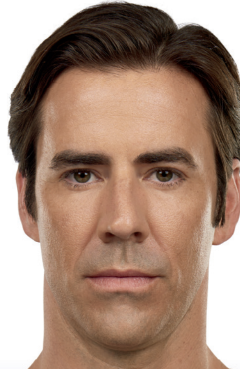
After optimal correction with JUVÉDERM VOLUMA® XC

Actual patient. Results may vary. Unretouched photo taken 1 month after treatment with JUVÉDERM VOLUMA® XC. A total of 1.0 mL of JUVÉDERM VOLUMA® XC was injected into the cheek area.